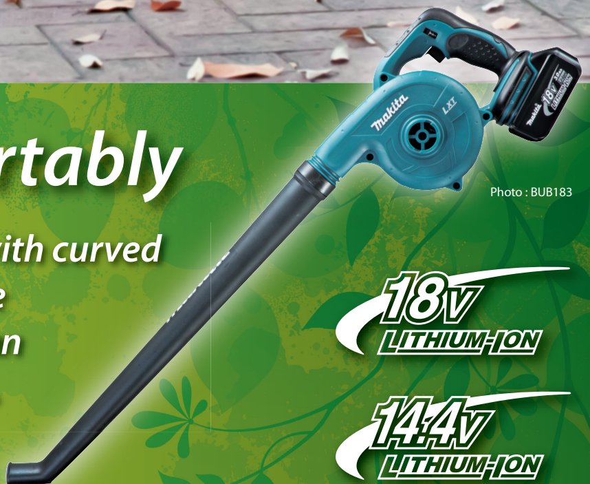
Photo : BUB183

Long leaf blower nozzle with curved flat end enables to use the machine comfortably in an upright standing posture.