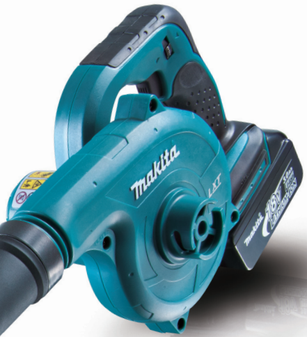
Photo : BUB183

Ergonomically designed handle with rubberized soft grip provides comfortable grip and more control while minimizing hand fatigue and pain.