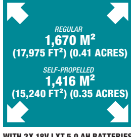
WITH 2X 18V LXT 5.0 AH BATTERIES