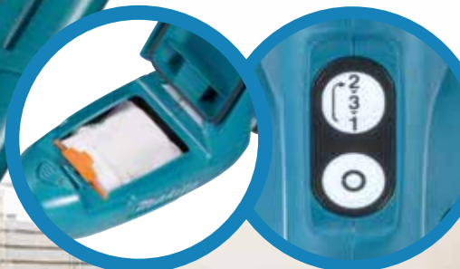
Paper bag type