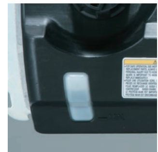
Large view window of Oil tank allows operator to easily check oil level.