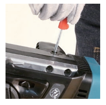
Improved oil pump keeps the delivery of chain oil constant regardless of temperature and the oil viscosity.