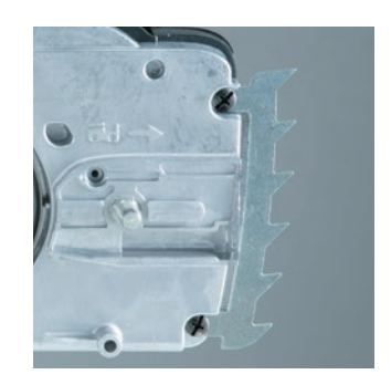
An optimum design has been achieved by employing separate-type. The spike grips workpiece firmly to provide more control.