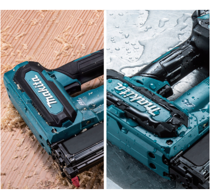
eXtreme Protection Technology