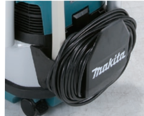
Convenient cord wrap