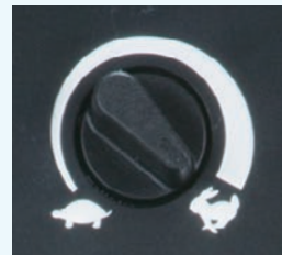
Variable suction power control by dial