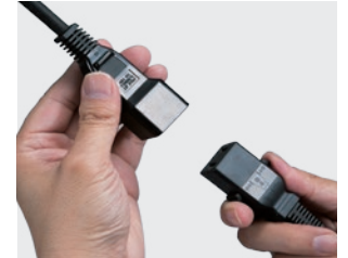
Removable power supply cord