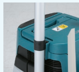
On-tool pipe storage