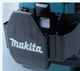
Removable storage box