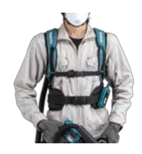
featuring shoulder and waist belts adjustable to suit user's size for less fatigue even after long continuous operation