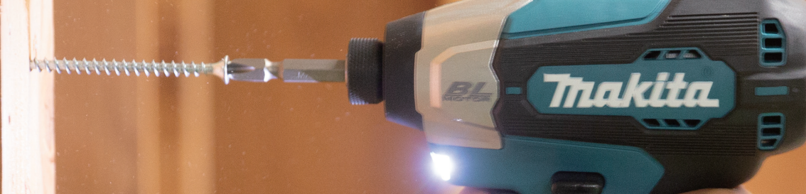
Bit is option