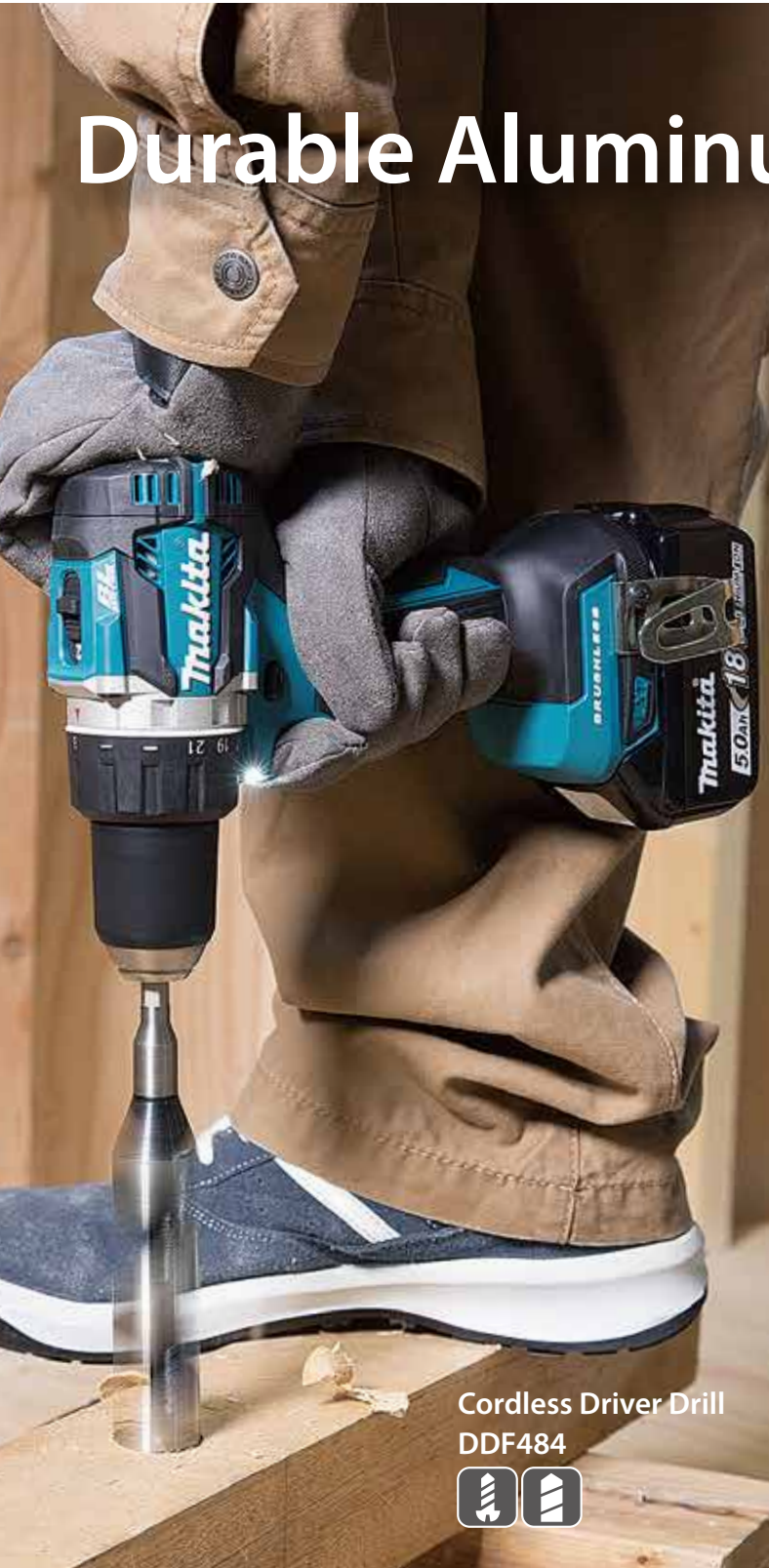
Cordless Driver Drill DDF484