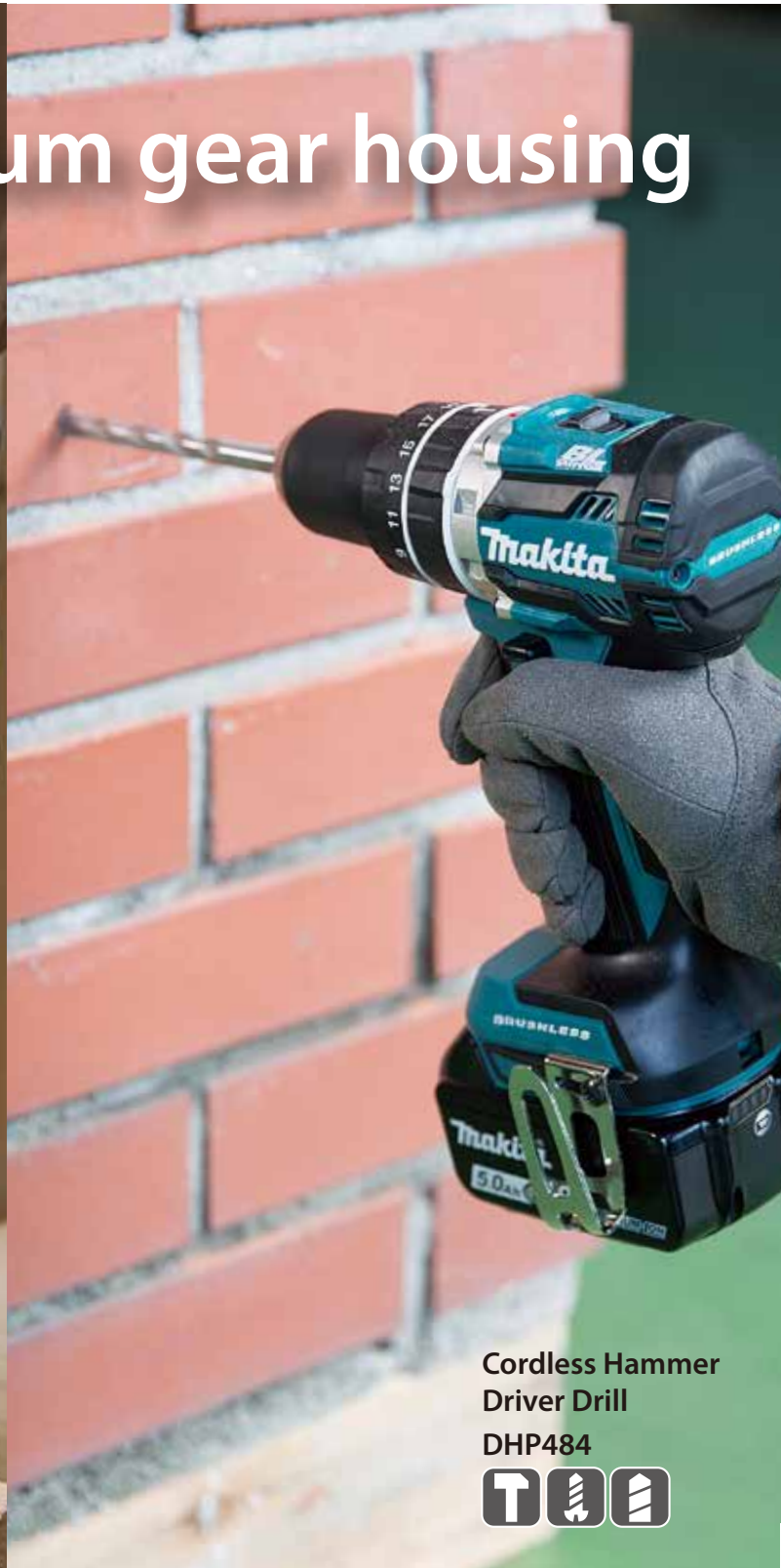
Cordless Hammer Driver Drill DHP484